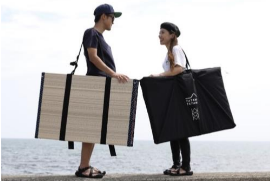
Shigezawa Tatami / TATAMITATAMI ¥27,390 (incl. tax)

Produced by a traditional tatami-making shop, you can take it wherever you go. Embrace the versatility of a tatami that offers both comfort and durability, inviting you to relax with full contentment.