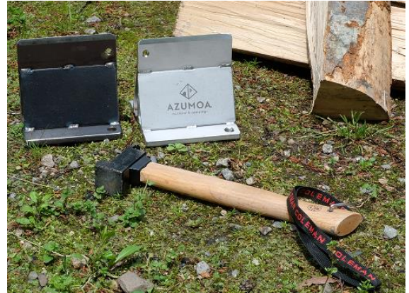
AZUMOA / MAKI chopper ¥15,400 (incl. tax)

Produced by a traditional tatami-making shop, you can take it wherever you go. Embrace the versatility of a tatami that offers both comfort and durability, inviting you to relax with full contentment.