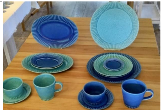
SAKUZAN / Plate L ¥4,620 (incl. tax)

The Seki sword was a favorite of samurai during the Warring States period. This beautiful and practical knife combines the traditional skills cultivated over its long history with Japan's world-class advanced processing technology.