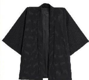
WAROBE / FLANNEL HAORI ¥38,500 (incl. tax)

Apparel that allows people to incorporate kimonos, which have long been popular in Japan as everyday wear, into their daily lives in a more familiar and comfortable way in the modern age.