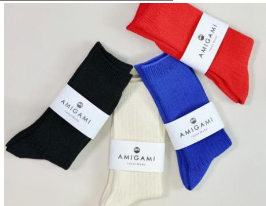
AMIGAMI / Mino-Washi socks ¥2,200 (incl. tax)

Apparel that allows people to incorporate kimonos, which have long been popular in Japan as everyday wear, into their daily lives in a more familiar and comfortable way in the modern age.